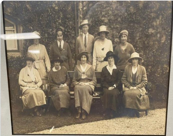
IRISH TEAM - NEWCASTLE 1920